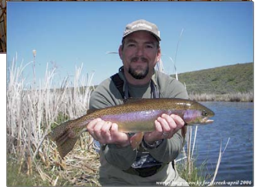
Rocky Ford Creek